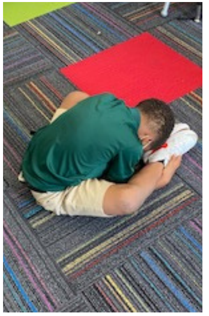
Students in Madame Maggie's class showing off the house they built and their yoga moves.